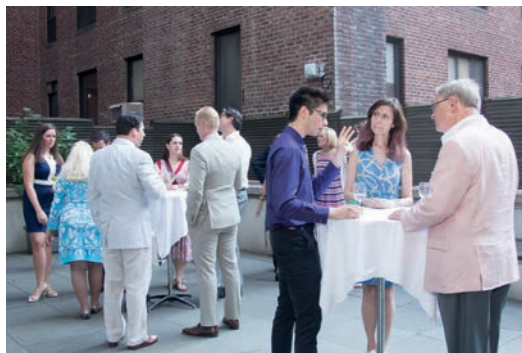
Guests Enjoying the Solstice Celebration