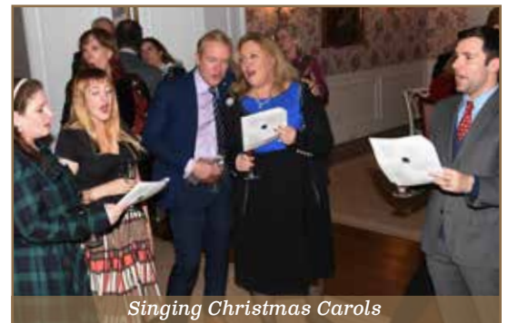
Singing Christmas Carols