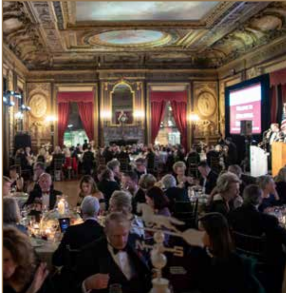
Guests During Dinner