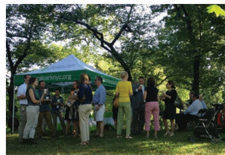
NES members and guests breakfasting atop Pilgrim Hill.