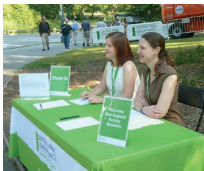
Breakfast registration desk with welcome sign for NES members.

Fundraising to support the Central Park Monument Program began in late 2012, and a cocktail reception was held in February 2013 to raise awareness about the initiative. Throughout the spring and summer work continued, culminating in a Breakfast with the Pilgrim in Central Park in July. The Central Park Conservancy hosted this event to thank NES for its support and to celebrate a relationship that predates the Park's opening.