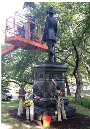
Conservation Technicians at work on The Pilgrim.

The Society is proud to announce the successful conclusion of the Central Park Monument Program, an important effort that helped to preserve and protect the statues and monuments in Central Park, including The Pilgrim statue donated by NES in 1885.